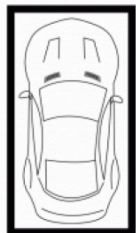
LUG APPROX. FLOOR AREA 16.0 SQ.M.

TOTAL APPROX. FLOOR AREA 111.0 SQ.M. Measurements are approximate. Not to Scale. For illustrative purposes only. Produced by Open2View.com.au