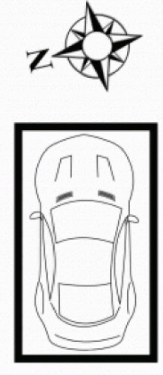
Produced by Open2view.com.au