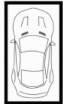
CAR SPACE APPROX. FLOOR AREA 14.0 SQ.M.